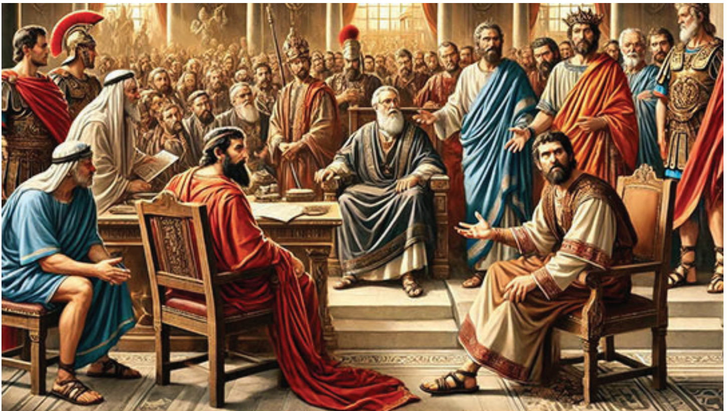
Acts 25 - Paul's Trial before Festus

Notes: Festus simply could not send Paul to Caesar with a letter that said: "I really don't know what this man is accused of and he is probably innocent of any wrongdoing, but I thought I should send him to you anyway." That was no way to be popular with Caesar.